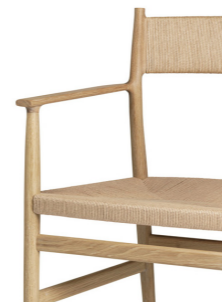
Oak, Oiled AVCA-OOL-02