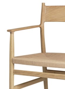
Oak, Oiled AVCA-OOL-01