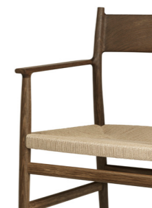
Fumed Oak, Oiled AVCA-OFU-01