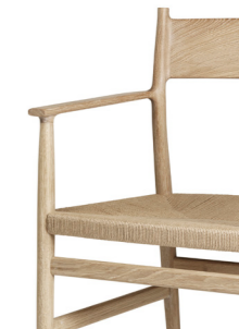
Oak, White Oiled AVCA-OWO