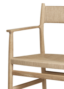
Oak, White Oiled AVCA-OWO-02