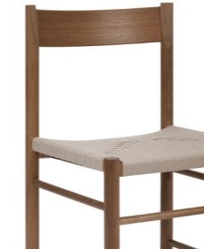
Fumed Oak, Oiled, Natural Linen, Webbing Seat FCCX-OFU-04