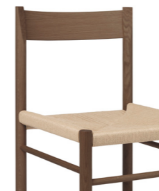
Fumed Oak, Oiled FCCX-OFU-01