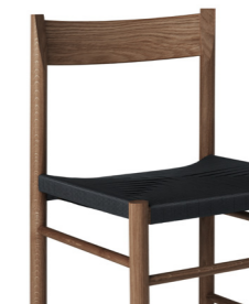
Fumed Oak, Oiled, Black Webbing Seat FCCX-OFU-11