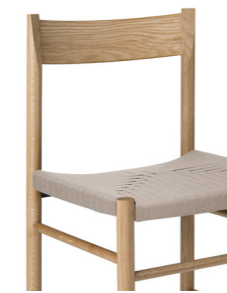
Oak, Oiled, Natural Linen, Webbing Seat FCCX-OOL-11