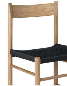
Oak, Oiled, Black Webbing Seat FCCX-OOL