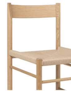
Oak, Oiled FCCX-OOL-01