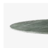
→ Verde Guatemala Marble