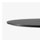
→ Nero Marquina Marble