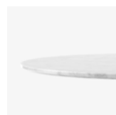
→ Bianco Carrera Marble