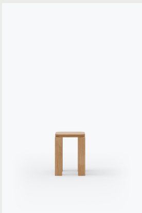
Item No: Variant: Oak