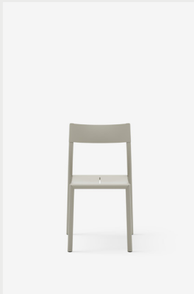
Item No: Variant: Light Grey