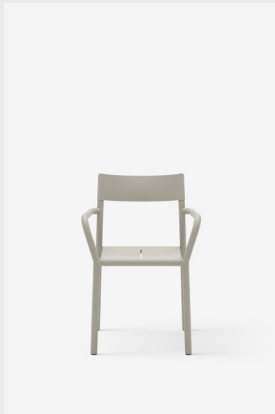
Item No: Variant: Light Grey