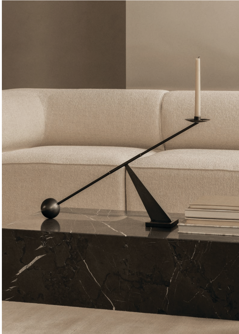
INTERCONNECT CANDLE HOLDER Designed by Colin King Studio