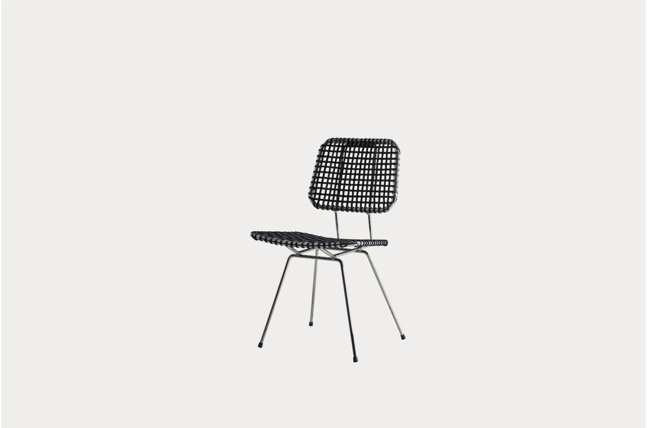
BRICK / CHAIR, Paola Navone

The Brick 23 chair without armrests has a structure in polished chromed steel rod. Light lines and low thicknesses are emphasised by the handwoven 8 mm rawhide strips, natural grey colour, riveted on the frame. Rawhide is a material obtained from the cow and its tension can change with time, especially in relation with humidity and change of temperature. This material is slightly stained (wax finish). Black polyethylene cap.