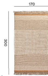
Rug Eco 02 White