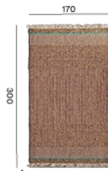
Rug Eco 02 Natural