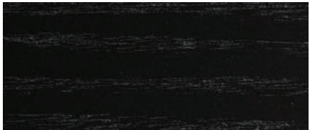
Black Stained Ash