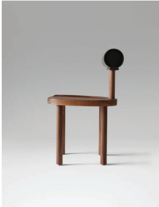
Oiled Walnut Black leather