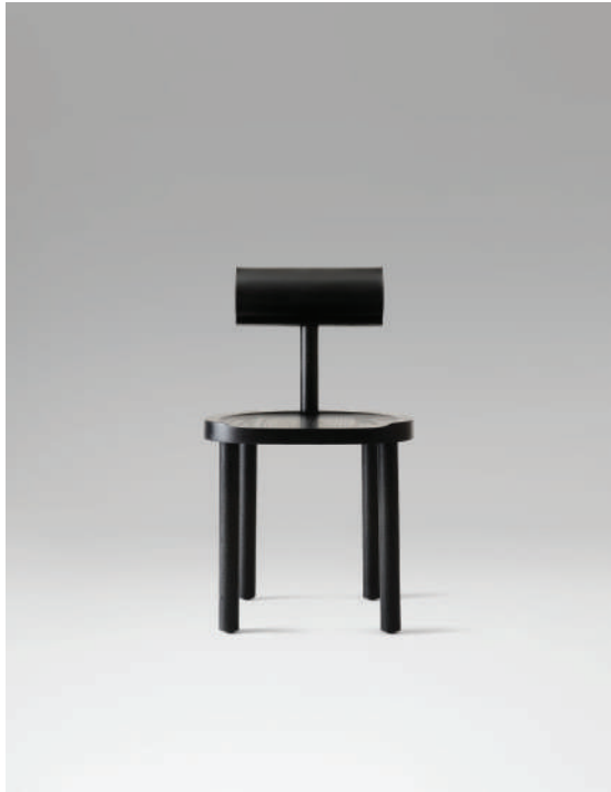
Black stained Ash Black leather