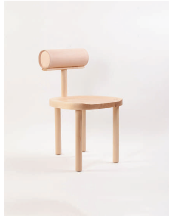
Maple Nude leather