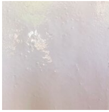
Concrete GFRC White