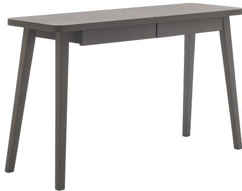
LC 60, Paola Navone

When a house becomes a space for thinking, creating and working, as well as for living, desks take on a whole new dimension: LC 60 is an elegant desk of rather small dimensions, designed in the name of practicality and functionality, combined with a focus on aesthetics. Solid oak frame, stained acrylic base coat and semi-open pore acrylic matt top coat. Wooden fibers panels flap top, oak veneer, with acrylic base coat and semi-open pore acrylic matt top coat.