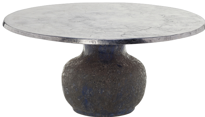
MOON / ROUND TABLE, Paola Navone

A bold combination of materials distinguishes the Moon 34-36 family of tables: the blue ceramic base in the shape of an amphora, characterised by an irregular material surface obtained with a particular hand finish, is combined with a round top, made of cast aluminium or white Carrara marble.