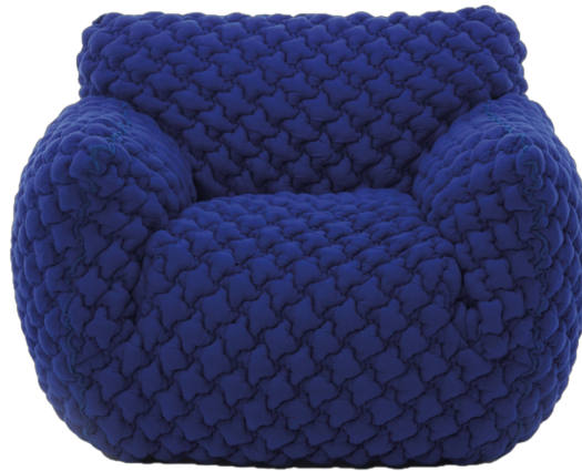
NUVOLA / ARMCHAIR, Paola Navone

A family of armchairs with soft and attractive shapes, Nuvola's aesthetic invites you to dive into it: the high armrests welcome a seat as deep as a hug, creating a real cocoon effect. Available in two sizes, they are padded with multi-density polyurethane foam covered with quilt padded with goose down and polyester fibre staple. Solid beech frame with raw plywood panels. The cover is removable with visible seams that draw the profile of the product, and can be made with all the covers available in the catalogue in the name of maximum versatility.