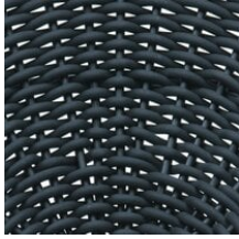
PVC Matt Black