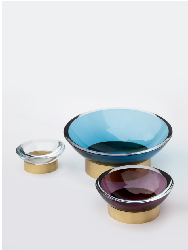
From left: Small/Clear, Large/Steel Blue, Medium/Plum on Brushed Brass rings