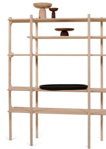
Tara Shelving System, tall