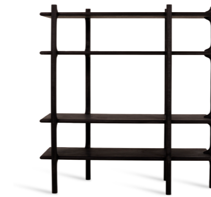
Tara Shelving System, low