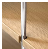
→ Chrome & Oak