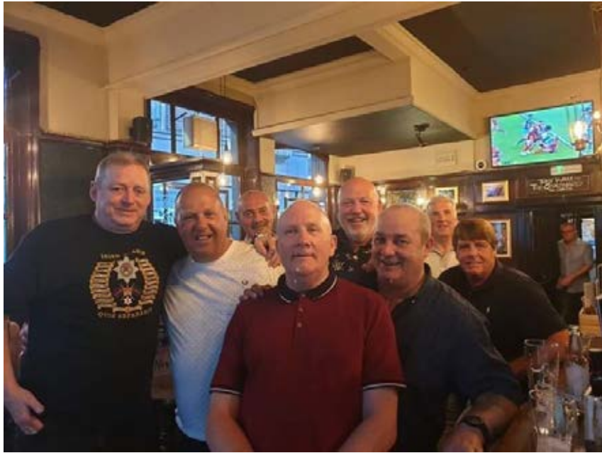
London 1 Coy Reunion 2019