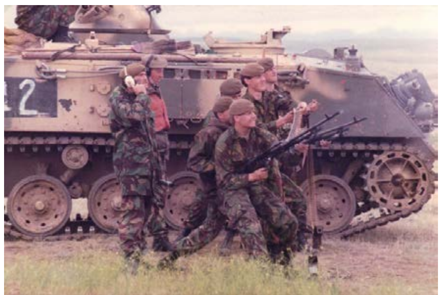
BATUS 1986 live firing at aircraft