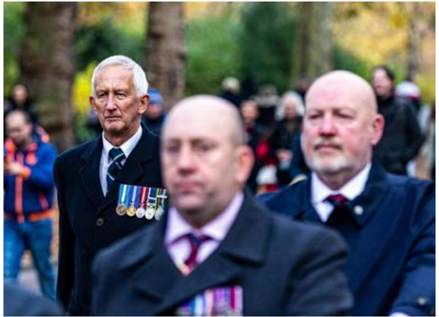
Black Sunday 2019