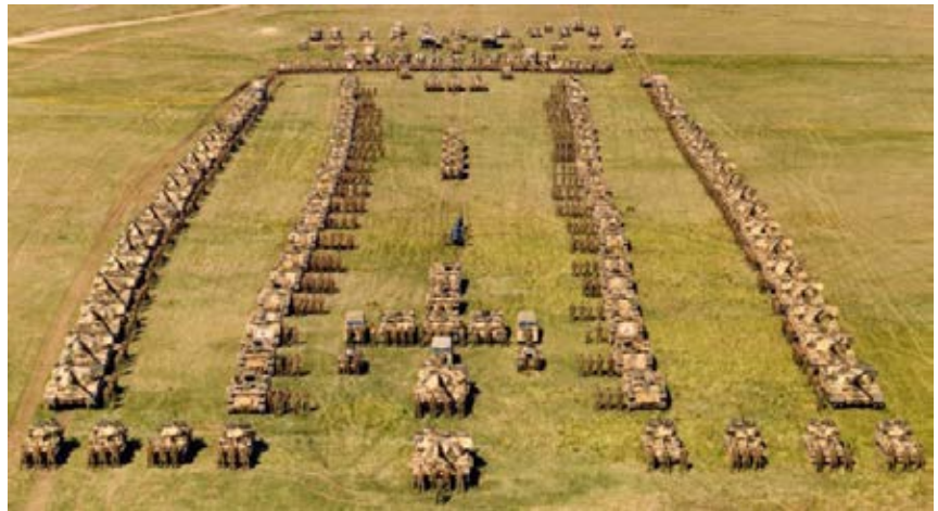
1IC Battle Group BATUS