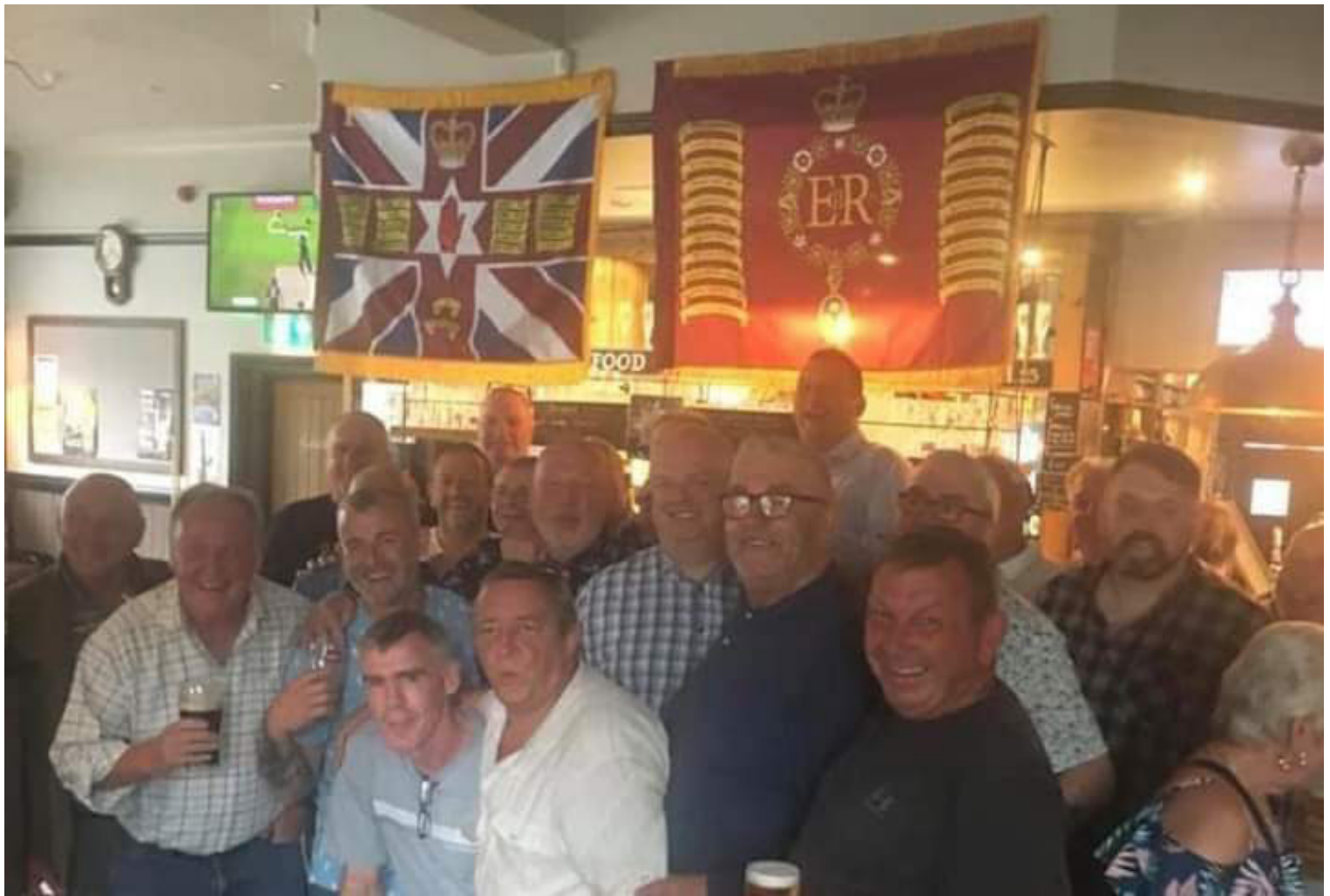
Bury Away Day 2019