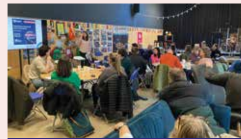
A Big MAP gathering

It's Ireland, so a refreshment break with food and chat is mandatory! This allows not only for useful networking but also simply for friendships to develop. So, a much-appreciated side-benefit of MAP membership has been that walking into a large event now means a chance to catch up with people, rather than arrival among a sea of unfamiliar faces.