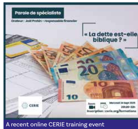
A recent online CERIE training event

Contemporary Thought, in partnership with the Evangelical Theological Seminary at Vaux-sur-Seine