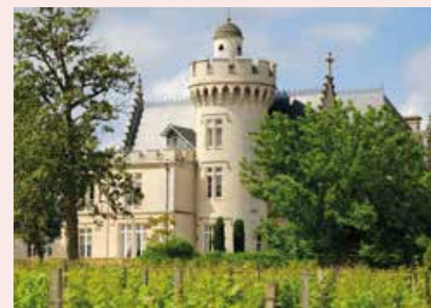
Château Pape Clément, near Pessac, the oldest wine estate in Bordeaux