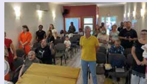
The Saint-Louis congregation

encouraged by the growth among the church, the love and unity amidst diversity, and the fact that there are lots of families and young people in the church. In this way it's similar to our church in Catford.