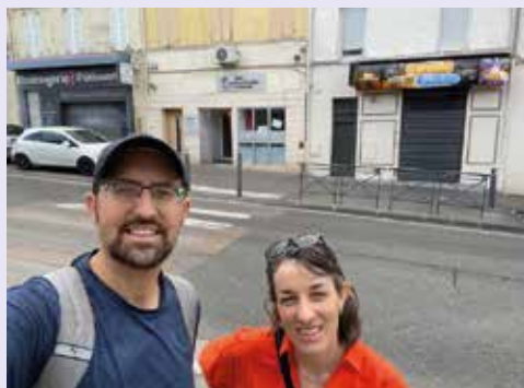
Outside the church