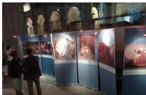
The exhibition in situ

From 12th-21st September as a church in Clichy we ran the exhibition “ De la Parole à la Peinture ” (From Word to Painting). The story of the Bible is depicted in 21 art works by well-known artists, taking the viewer from Genesis to Revelation, from creation to the new creation. Visitors can enjoy commentary followed by carefully selected musical items on an audio guide. QR codes now even allow people to listen along on their phones, in French, Chinese or English.