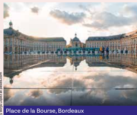
Place de la Bourse, Bordeaux

You can contact Arnaud at arnaud.schrodi@yahoo.com