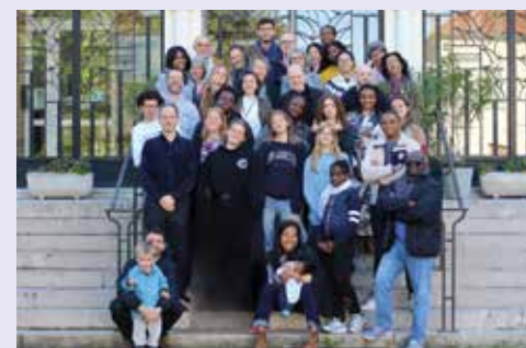
Church weekend group photo