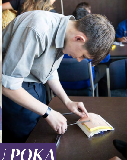
TE RAU POKA