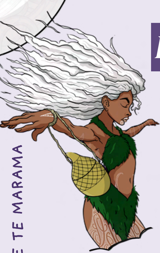
RONA ME TE MARAMA