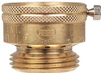
Yard Hydrant Hose Bib Vacuum Breaker

Yard Hydrants are required by State law to have a proper working backflow prevention device to prevent contamination of our water supply and system. Please notify a Board Member if you do not have a yard hydrant hose bib vacuum breaker on all your hydrants or if it is not working properly.