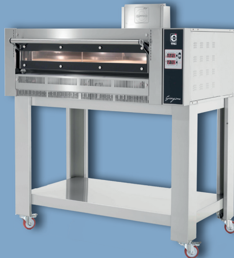
SINGLE DECK WITH MOBILE STAND (supplied separately)