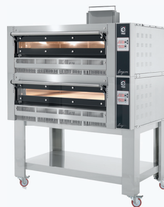
TWIN STACKED WITH MOBILE STAND

You don't need a stacking kit - simply stack one on top of the other