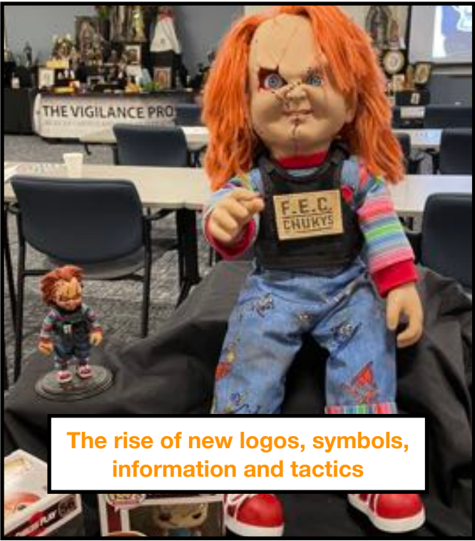
The rise of new logos, symbols, information and tactics