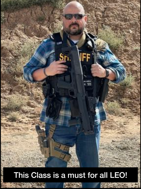
This Class is a must for all LEO!