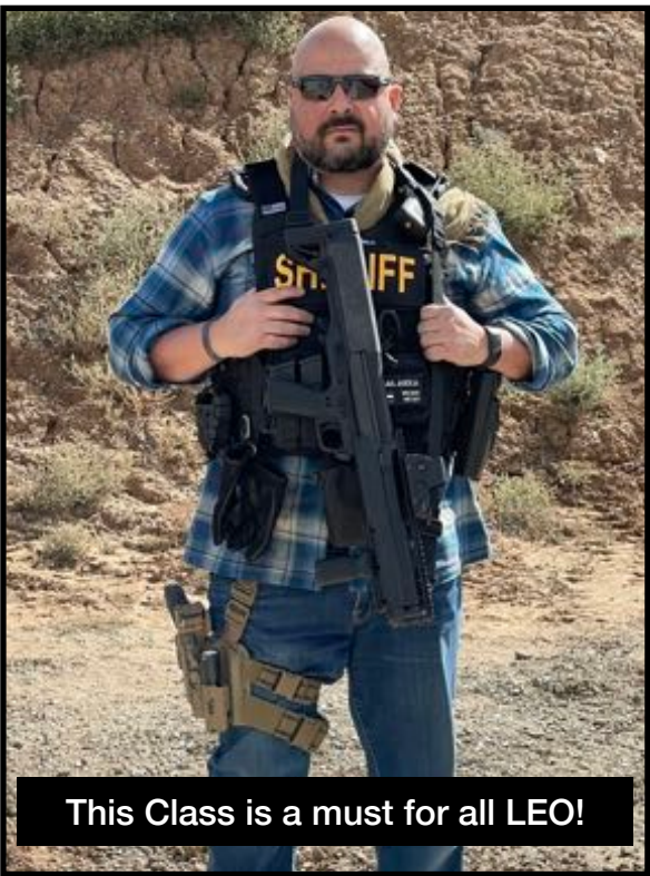
This Class is a must for all LEO!