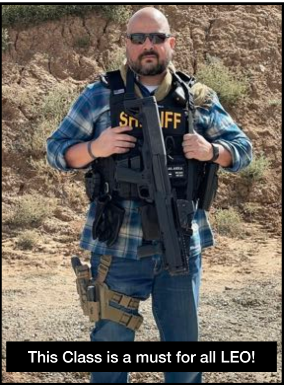
This Class is a must for all LEO!