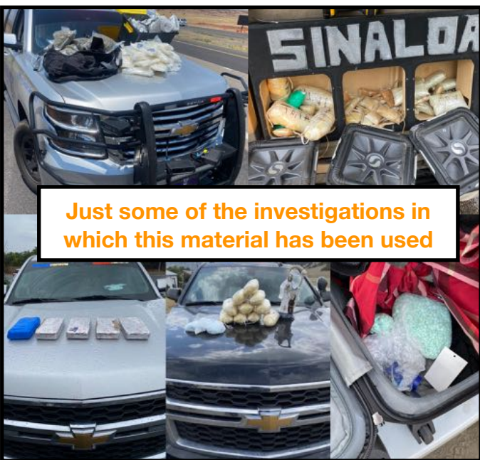
Just some of the investigations in which this material has been used