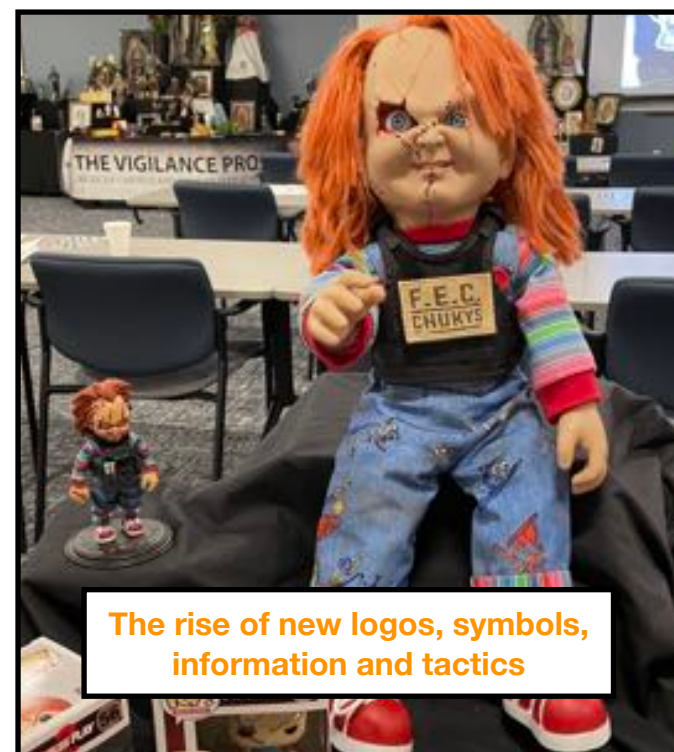
The rise of new logos, symbols, information and tactics