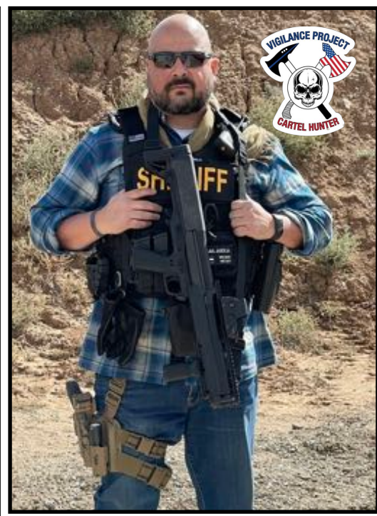
This Class is a must for all LEO!