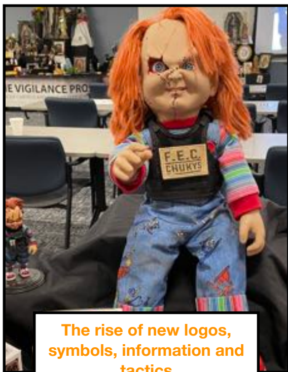
The rise of new logos, symbols, information and tactics