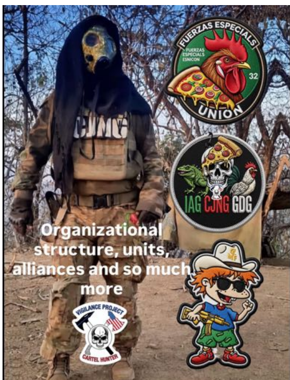
Organizational structure, units, alliances and so much more