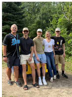
My family at camp Michigania!