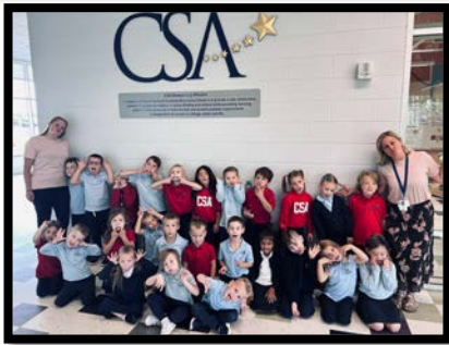
Beluga Family class picture! Of course we also needed to take a silly one. :)