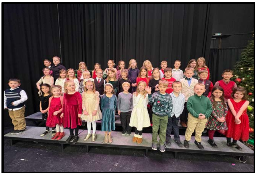
Above: Our Christmas concerts were another beautiful moment for our Narwhal learners and families. Students did such a wonderful job practicing and performing for the shows and we hope you delighted in this beautiful tribute to all of our amazing families!

Leggings are not permitted except as extra layers for recess or carpool. Pants must be navy blue.