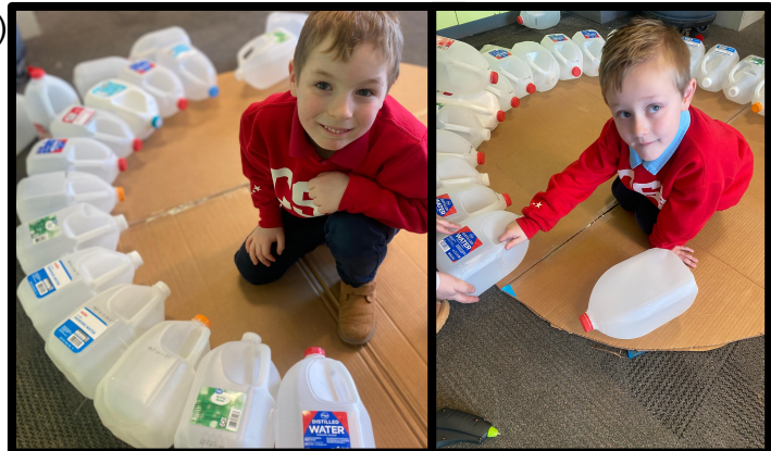
In January we began work on our Milk Jug Igloo! Please continue to send in dry & cleaned out water/milk jugs! We cannot wait to complete this exciting project together!