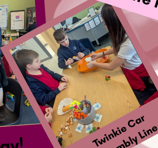
Twinkie Car Assembly Line