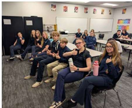
BATTLE OF THE BOOKS!!!!!!