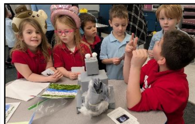
Explorer students created sculptures and writing pieces about their chosen animal. They taught Spotted students all about their animal.