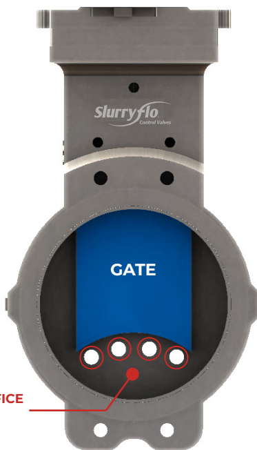
CHOKED FLOW POSITION