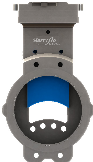
FLOW CONTROL POSITION