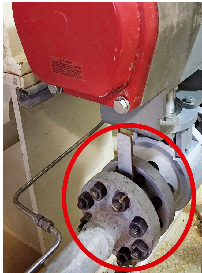
Restriction orifice on the outlet flange of a ball valve.

The choked flow mode of operation prevents slack flow, while the high-pressure drop can be used to induce liquid flashing within the pipe. When these secondary operations are not required, flow is diverted back to the primary line and the control valve is used to modulate flow.