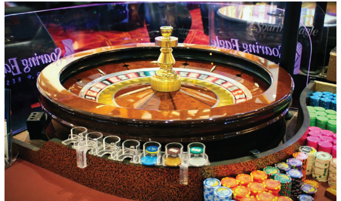
Roulette wheel at Soaring Eagle Casino

Game Speed: The new pricing strategy reduced the number of chips on the layout by 26%, leading to faster payouts and an increased game speed.