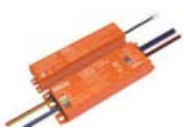
SZ-EMXXW-Y-WP Emergency Driver