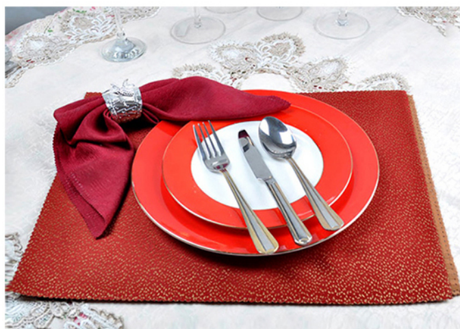
P003 平盘 Flat Plates Size D(inch) / D×H(cm) 6.25 / 15×1.9 7" / 17.8×1.9 8" / 20.3×2.5 9" / 22.8×2.5 10" / 25.4×2.5 10.5" / 26.6×2.5 11" / 27.9×2.5 12" / 30.4×2.5 14" / 35.5×2.5