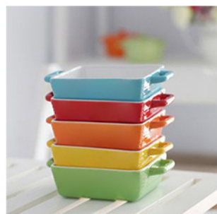
BUF060 正方形双耳小炒锅 Size C / L(inch) / L×W×H(cm) 400ml / 7" / 17.8×12.7×4.5