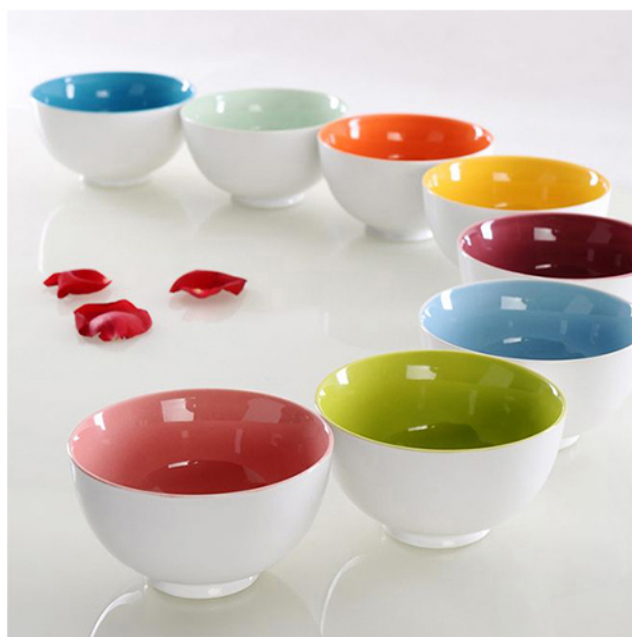
B012 企口碗 Round Bowl Size C / D(inch) / D×H(cm) 180ml / 4" / 10×5 280ml / 4.5" / 11.4×5.7 360ml / 5" / 12.7×6.3 600ml / 6" / 15.2×7 950ml / 7" / 17.7×8.2 1300ml / 8" / 20.3×8.9 2100ml / 9" / 22.8×10.7