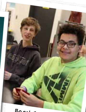
Board Game Club