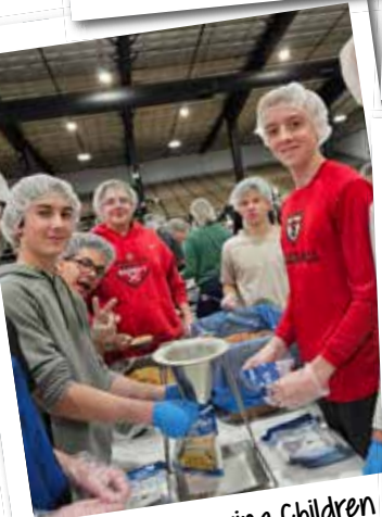
Feed My Starving Children