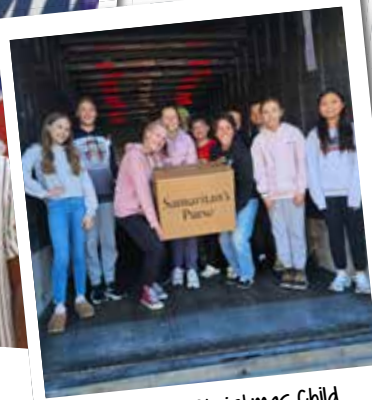
Operation Christmas Child