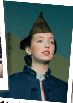
Fall Theatre Production