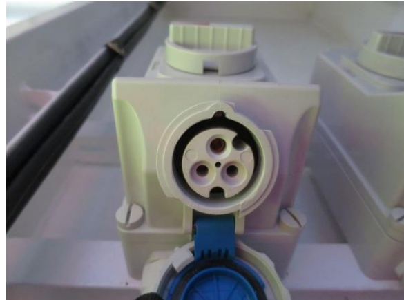
Reefer Connection type