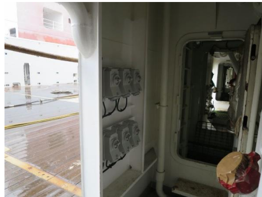
Reefer Connection PS