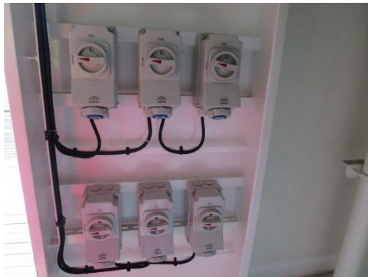
Reefer Connection PS

6 pcs 200V-260V 16A 2-phase+ground type QX7012 midship starboard side frame #39