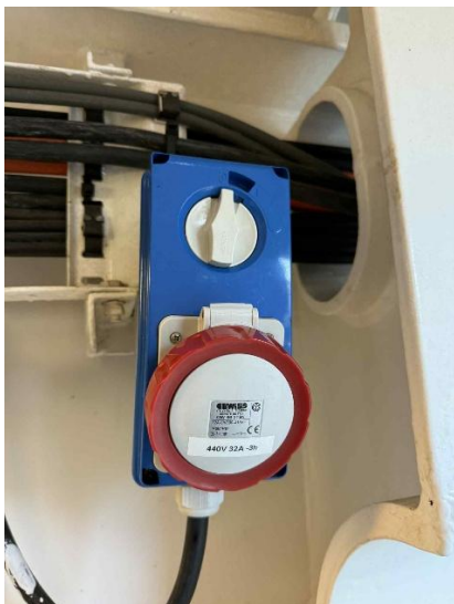
2 x 400V, 32A – Main Deck SB, #53