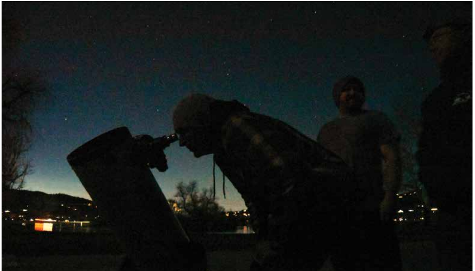
File Public Viewing 02: Claude Plymate