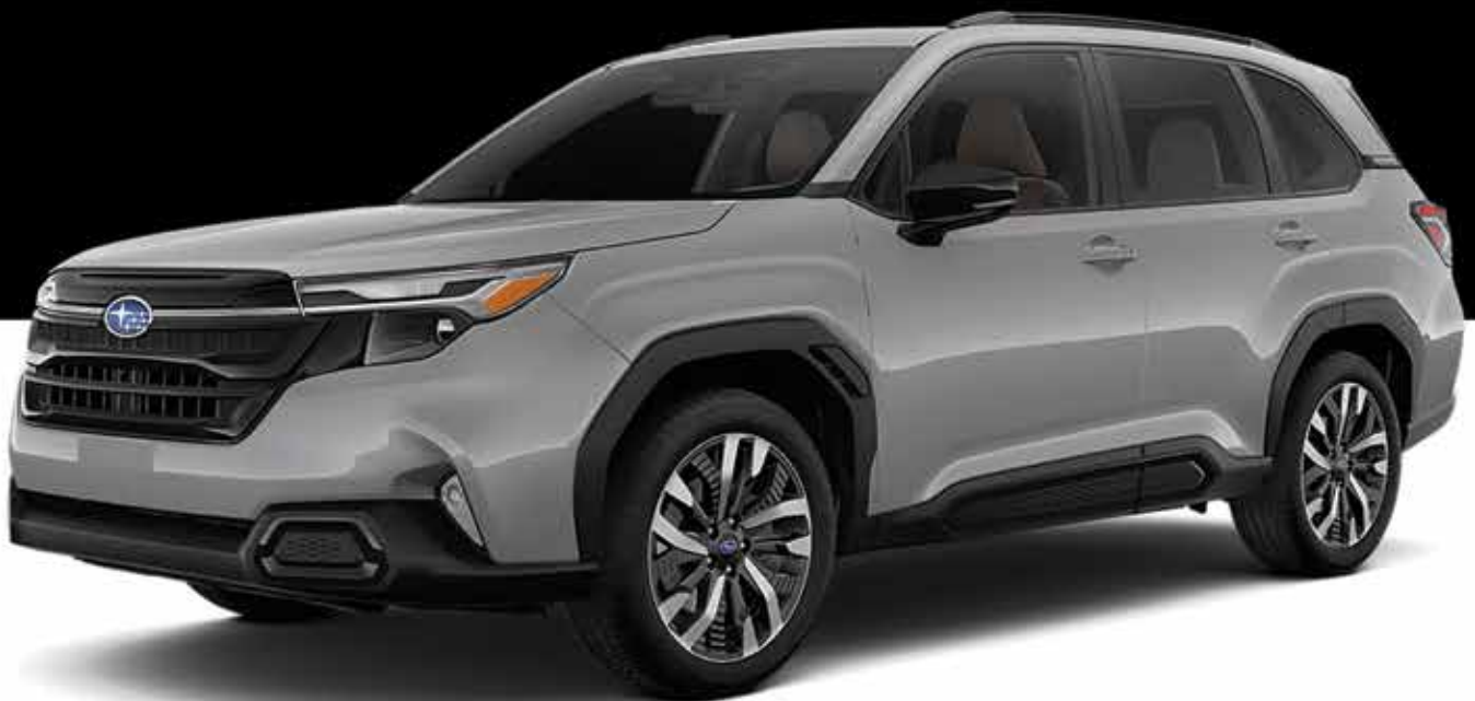
2025 Forester Touring shown

Whatever adventures you have planned, the flexible, capable Forester all-wheel-drive compact SUV is ready to take them on. With standard Symmetrical All-Wheel Drive, you can handle all kinds of weather and road conditions with confidence.