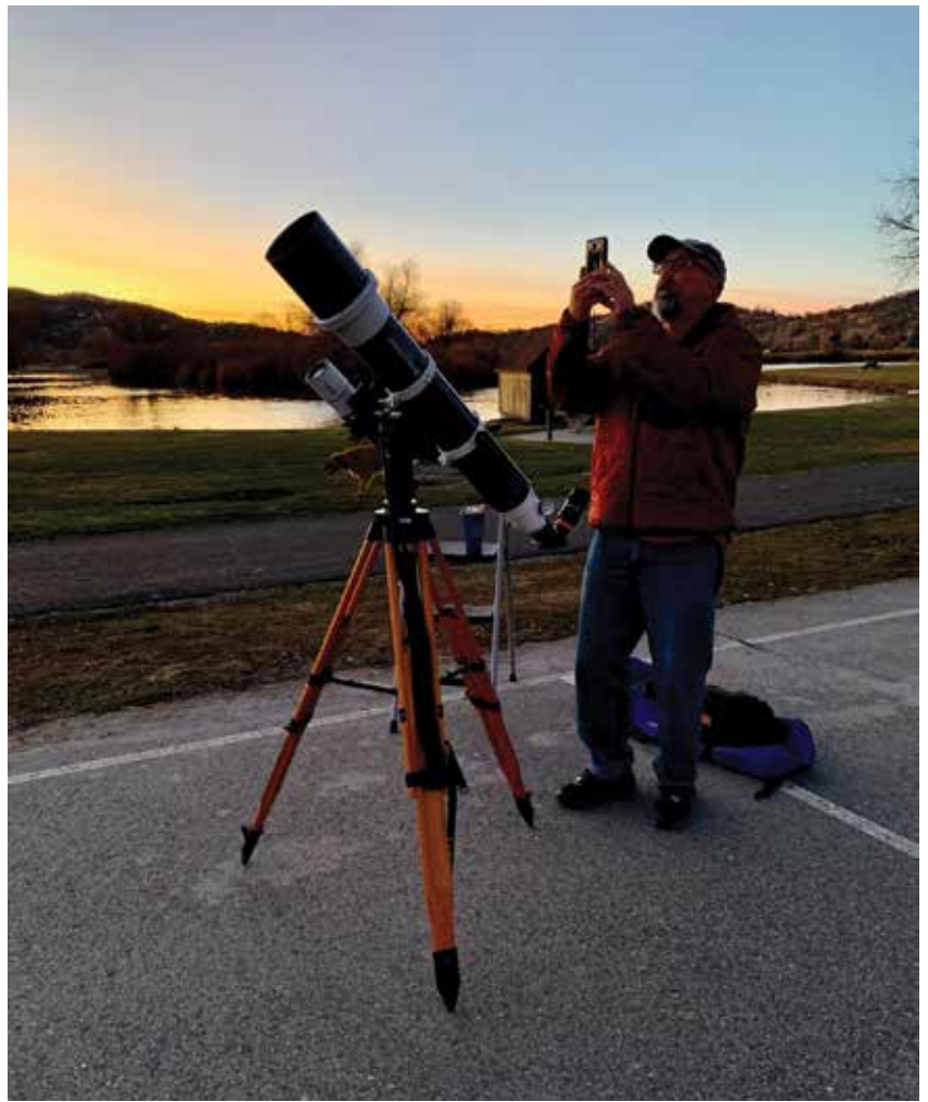
File Public Viewing 01: Credit Denise C. Lewis

The public viewing nights for 2025 are currently scheduled for: Jan. 4, Feb. 8, March 8, April 5, May 3 and 31, (Not in July as would conflict with the 4th), Aug. 2 and 30, Sept. 27, Oct. 25, Nov. 29 and Dec. 27. 🐾