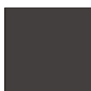
SilPruf SCS6000.03 Black