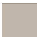
SilPruf SCS6000.04 Limestone