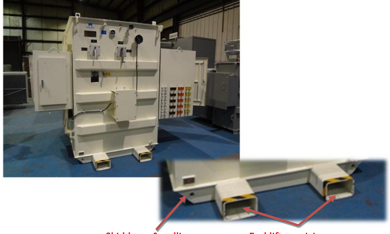
Skid base & pulling eyes

Multiple high and low voltage windings can be supplied to cover all site load requirements. High voltage terminations may be live front, dead front OR both. The low voltage side may be supplied with circuit breakers.