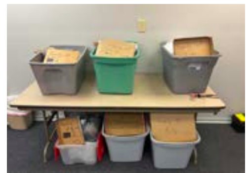
Mt. Sterling First United Methodist Church's Grace Place is caring for children and families in their community.