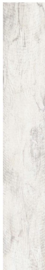
SBIANCATO 8" x 48"*