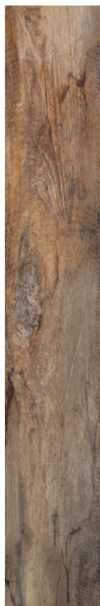
MARRONE 8" x 48"