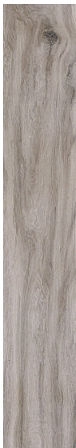
GRIGIO 8" x 48"