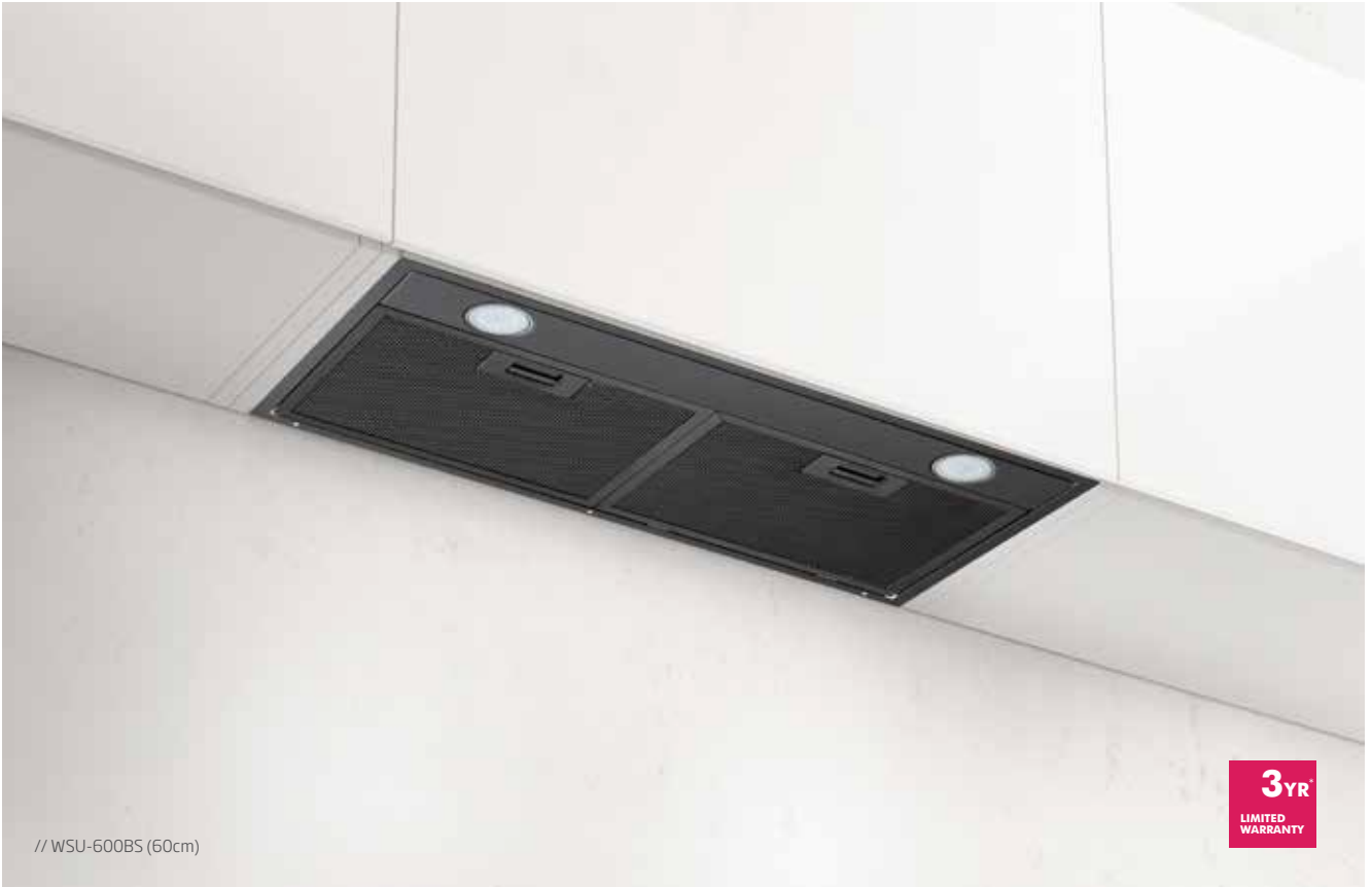
// WSU-600BS (60cm)