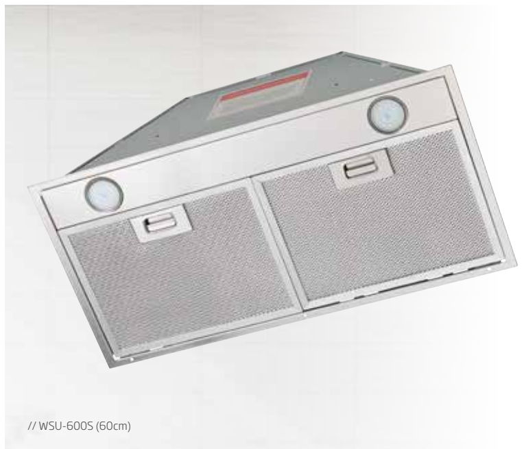
// WSU-600S (60cm)

* Note: 2 gang wall switch is not provided