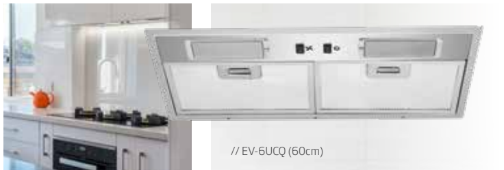
// EV-6UCQ (60cm)

Perfectly designed for discreet mounting inside cabinetry, the popular EV-9UCQ and EV-6UCQ fit perfectly into kitchen cabinetry and are ideal for kitchens where space is limited, or where the rangehood needs to be out of sight.