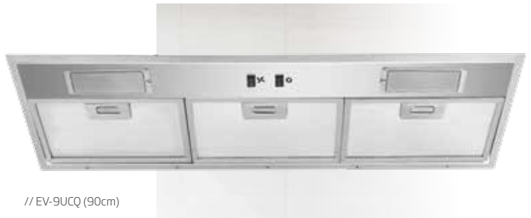
// EV-9UCQ (90cm)