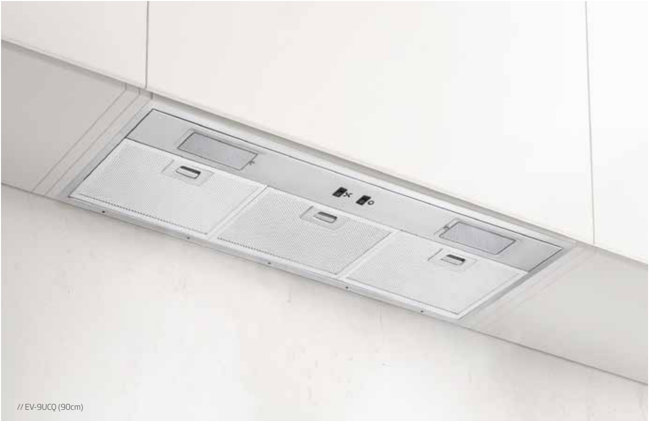
// EV-9UCQ (90cm)