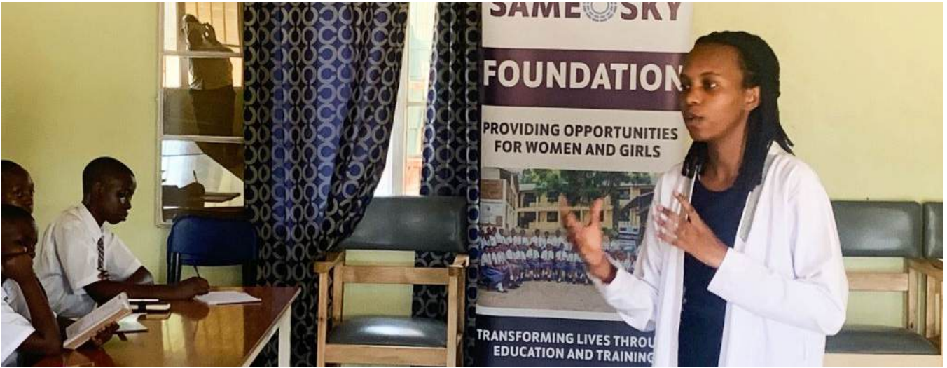
Same Sky Scholars participating in a mentorship session at Fawe Girls' School