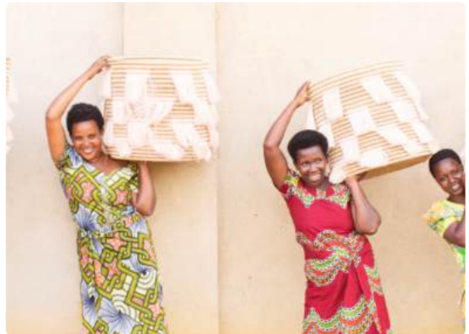
Same Sky Cooperative members and Rwandan artisan partners — Kigali, January 2026

Summary: The Same Sky Foundation x Indego Africa Artisan Small Business Incubator empowers 700 Rwandan women artisans across 17 cooperatives in 4 provinces with market access, vocational training, and business support, building lasting economic resilience through craft.