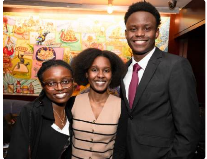
LeFrak-Friedberg Scholars at the annual LeFrak Summit in New York City

Summary: Investing in the leadership pipeline for Africa by supporting university-level scholars in every discipline, including Medicine, Software Engineering, and Entrepreneurship. Our LeFrak-Friedberg Scholars Summit is an extraordinary convening elevating students' opportunities.