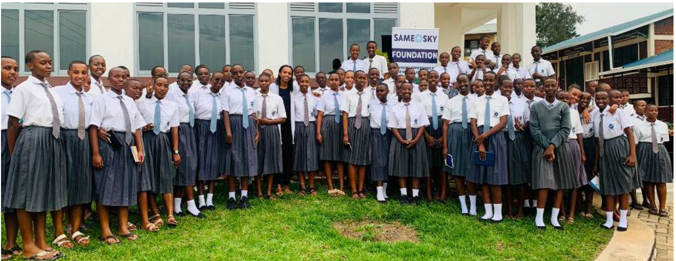
Same Sky Scholars cohort group photo

Summary: This secondary education program focuses on girls in Gisozi, Rwanda, specifically steering them toward STEM and financial literacy.