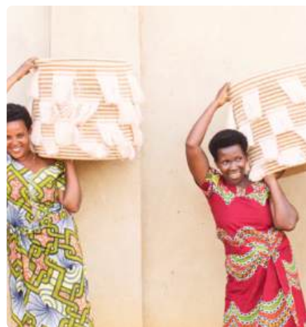
Same Sky Foundation x Indego Africa, empowering women artisans in Rwanda