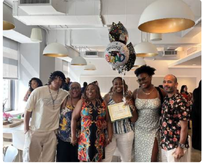
Grace Institute participants in training and celebrating graduation

Summary: Grace Institute remains a primary engine for economic transition in New York City. By providing specialized training in Healthcare and Administrative tracks, the program moves women from an average pre-program wage of $5.03/hr to a career-path average of $24.11/hr .